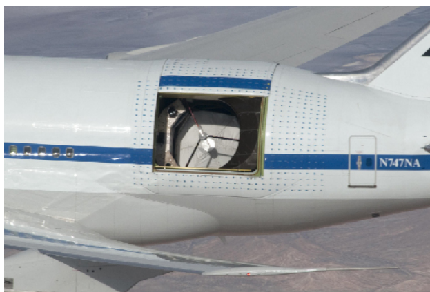
Figure 6.23 Stratospheric Observatory for Infrared Astronomy (SOFIA). SOFIA allows observations to be made above most of Earth's atmospheric water vapor.