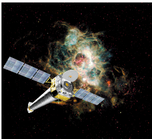
Figure 6.26 Chandra X-Ray Satellite. Chandra, the world’s most powerful X-ray telescope, was developed by NASA and launched in July 1999.

is an enormous technological challenge. The 2002 Nobel Prize in physics was awarded to Riccardo Giacconi, a pioneer in the field of building and launching sophisticated X-ray instruments. In 2008, NASA launched the Fermi Gamma-ray Space Telescope, designed to measure cosmic gamma rays at energies greater than any previous telescope, and thus able to collect radiation from some of the most energetic events in the universe.