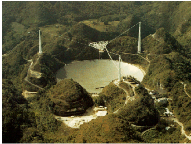
Figure 6.22 Largest Radio and Radar Dish. The Arecibo Observatory, with its 1000-foot radio dish-filling valley in Puerto Rico, is part of the National Astronomy and Ionosphere Center, operated by SRI International, USRA, and UMET under a cooperative agreement with the National Science Foundation.